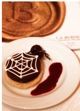
Boris’s “Home Sweet Home” Chocolate Tart from Burdick Chocolate