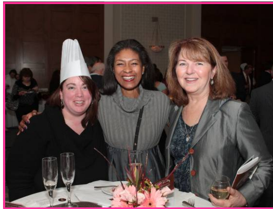
CHAF supporters enjoy the evening