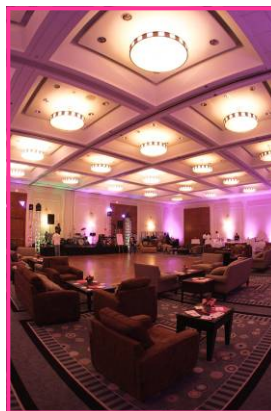
Cort Furniture and Pure Energy Entertainment provided a comfortable lounge-style setting