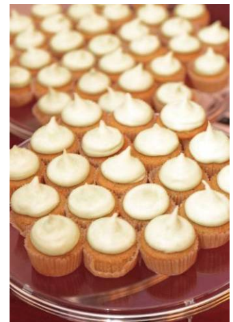
Caramel Apple-Tini from Kickass Cupcakes