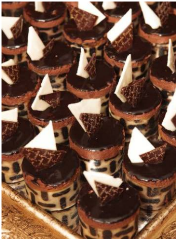
Manjari Chocolate Mousse from Finale Desserterie