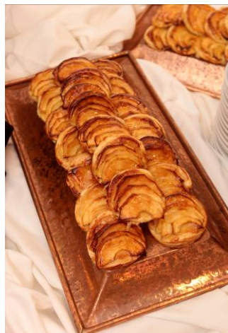
Apple Tart Tatin with Crème Anglaise and Chocolate Sauce from Sandrine’s Bistro