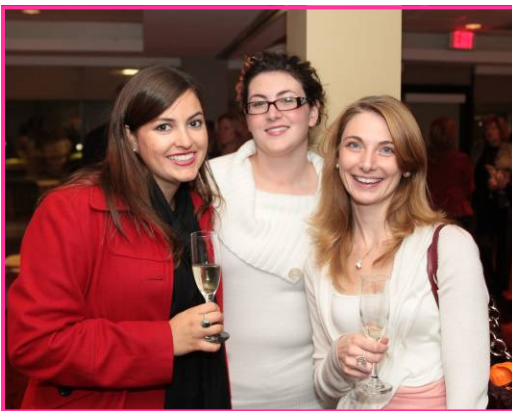
CHAF supporters sample champagne in the VIP room.