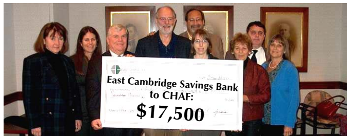
East Cambridge Savings Bank presents a 'big' check to CHAF board

"This year, the Bank, as lead sponsor of Home Sweet Home, donated $15,000 from the East Cambridge Savings Charitable Foundation and an additional $2,500 as a match to a live auction guest spot on