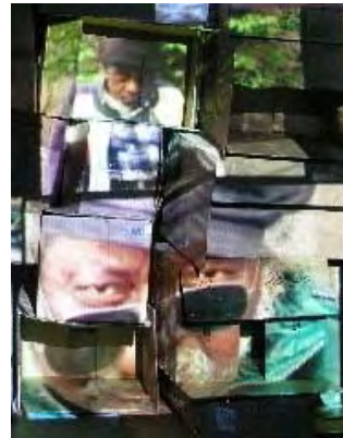
Set of regardisregard

This year's concert was dedicated to the music of legendary composers Stephen Sondheim and